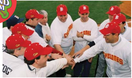
Generous sponsors team up to support a valuable cause while enjoying a fun day on the field.