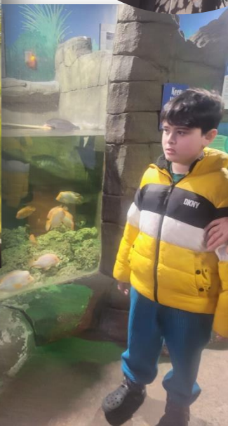
Galaxy S21 5G