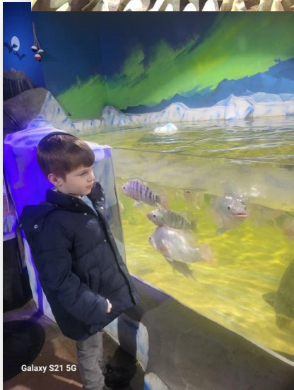
Galaxy S21 5G