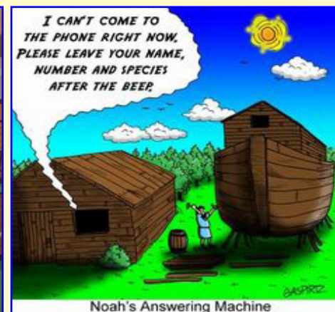
Noah's Answering Machine